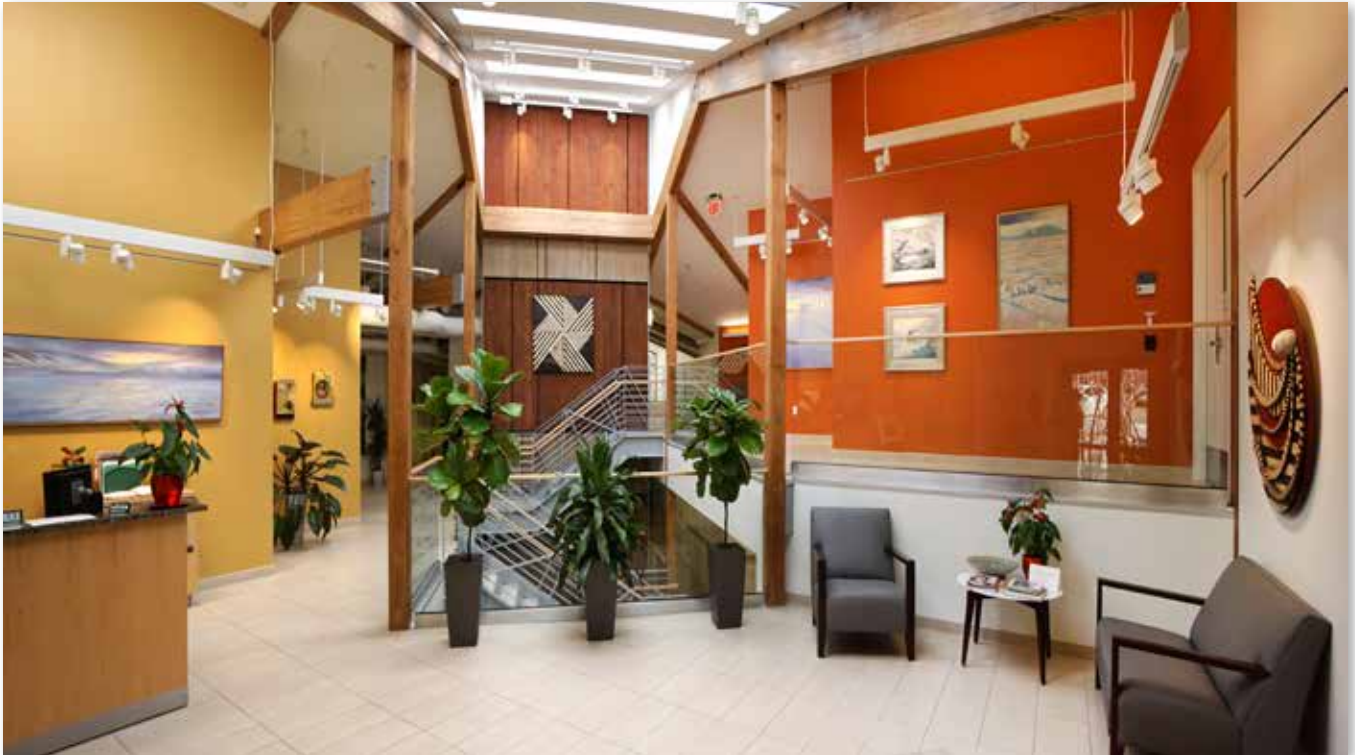
CST gallery and reception area at Beverly's Tozer Rd. facility.

As a dedicated patron of the arts, CST hosts two separate in-house art galleries located in our Danvers and Beverly facilities. Works from regional and local artists are rotated between both buildings producing three new exhibits each year. Informal "art talks" and receptions with featured artists allow CST employees to take a break from work and acknowledge the creative contributions artists bring to our workplace and to our communities.